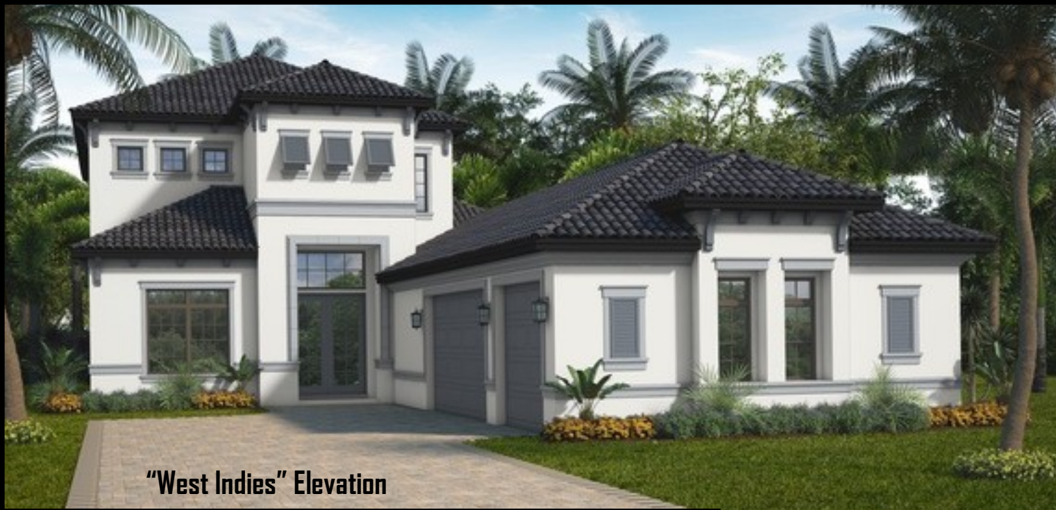
"West Indies" Elevation

~ Available In Several Front Elevation Styles ~ Gold Coast Custom Homes Has Perfected The Process Of Delivering High Quality Custom Homes For Our Clients. Our Riverwalk Plan Is Perfect For Palm Coast Plantation And Many Other Gated Communities. With 3518 Living Sqft, This 2 Story Custom Home Features A Soaring 20+' Ceiling In The Grand Foyer & An Open Great Room Concept Perfect For Larger Families. This Custom 3 Bedroom 3.5 Bath With Study And Home Theater Can Be Easily Modified To Fit Your Life Style. All Our Homes INCLUDE Many Upgrades Standard: 11'-12' + Ceilings In The Main Areas, (3) Tray Ceilings, Brick Pavers, Large Island In Kitchen Maple Cabinetry W. Crown Molding, Light Rail In The Kitchen, Plus Much, More! Call Today To Discuss The Next Steps in Building Your Dream Home.