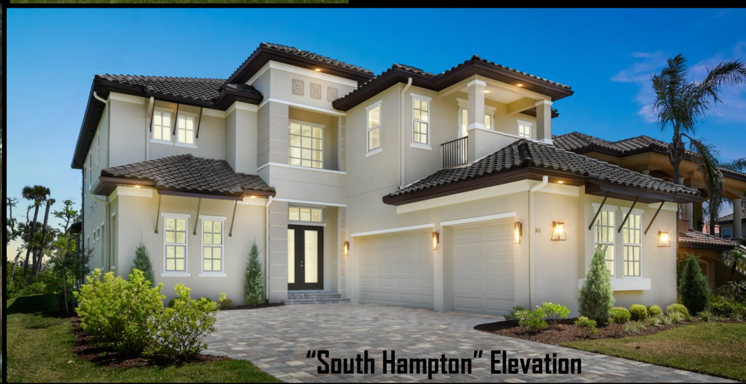
"South Hampton" Elevation