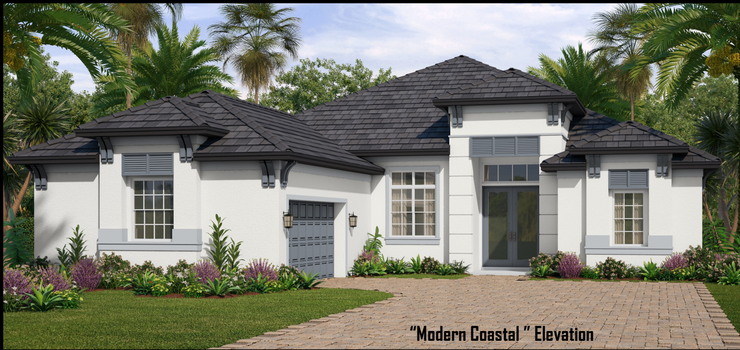
"Modern Coastal" Elevation

~ Available In Several Front Elevation Styles ~ Gold Coast Custom Homes Has Perfected The Process Of Delivering High Quality Custom Homes For Our Clients. Our St. Charles Plan Is A Spaciously Designed Luxurious Custom Home. With 2852 Living Sqft, This Spaciously Designed 3 Bedroom 3 Bath With Study Features A Grand Open Great Room Layout Perfect For Entertaining And Larger Families. All Our Homes INCLUDE Many Upgrades Standard: 11'-12'+ Ceilings In The Main Areas, (3) Tray Ceilings, Brick Pavers, Large Island In Kitchen, High Quality Tile In Main Areas, Custom 42" Maple Cabinetry W. Crown Molding, Light Rail In The Kitchen, Plus Much, Much More! Call Today To Discuss The Next Steps In Building Your Custom Dream Home.