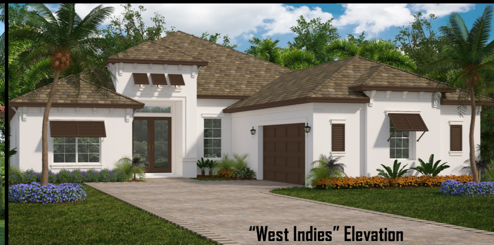
"West Indies" Elevation