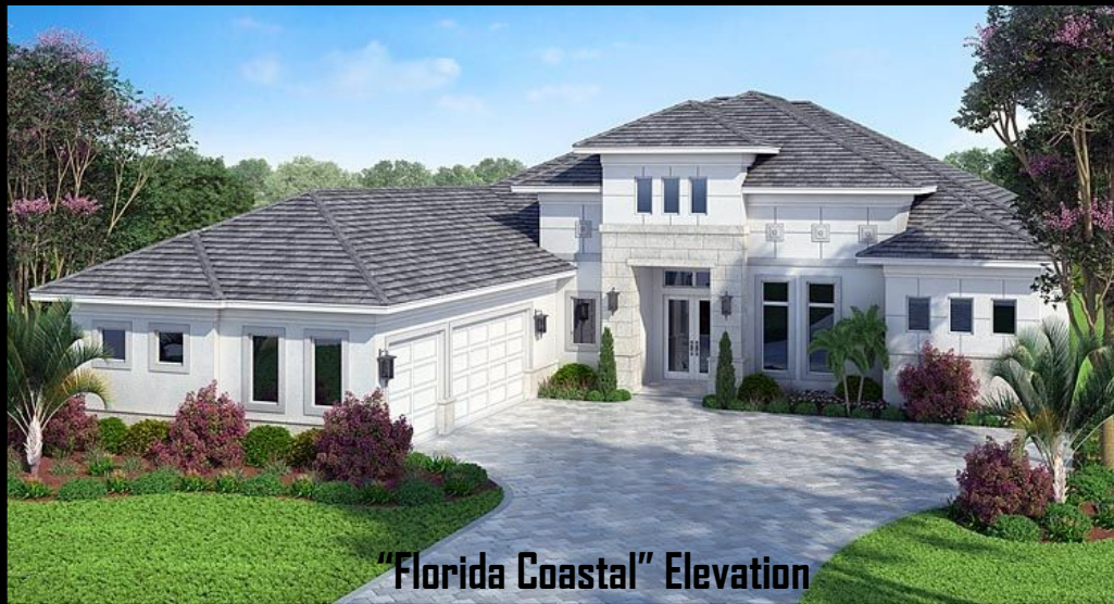
"Florida Coastal" Elevation

~ Available In Several Front Elevation Styles ~ Gold Coast Custom Homes Has Perfected The Process Of Delivering High Quality Custom Homes For Our Clients. Our Isabella Plan Is Perfect For Estate Size Properties In Gated Communities And On Your Private Land. With 3950 Living Sqft, This Custom Home Features An Expansive Open Great Room Concept Designed For Larger Families And Entertaining. With 4 Bedrooms, 4.5 Baths, A Study And A Den, This Custom Home Can Be Easily Modified To Fit Your Preferences And Life Style. Our Homes INCLUDE Many Upgrades Standard: 11'-12'+ Ceilings In The Main Areas, (3) Tray Ceilings, Brick Pavers, Large Island In Kitchen Maple Cabinetry W. Crown Molding, Light Rail In The Kitchen, Plus Much, More! Call Today To Discuss The Next Steps in Building Your Dream Home.