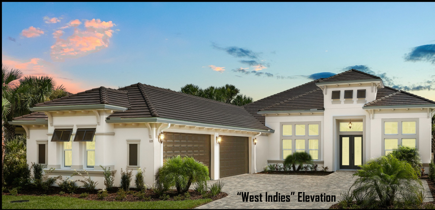
"West Indies" Elevation

~ Available In Several Front Elevation Styles ~ Gold Coast Custom Homes Has Perfected The Process Of Delivering High Quality Custom Homes For Our Clients. Our Isabella Plan Is Perfect For Estate Size Properties In Gated Communities And On Your Private Land. With 3950 Living Sqft, This Custom Home Features An Expansive Open Great Room Concept Designed For Larger Families And Entertaining. With 4 Bedrooms, 4.5 Baths, A Study And A Den, This Custom Home Can Be Easily Modified To Fit Your Preferences And Life Style. Our Homes INCLUDE Many Upgrades Standard: 11'-12'+ Ceilings In The Main Areas, (3) Tray Ceilings, Brick Pavers, Large Island In Kitchen Maple Cabinetry W. Crown Molding, Light Rail In The Kitchen, Plus Much, More! Call Today To Discuss The Next Steps in Building Your Dream Home.