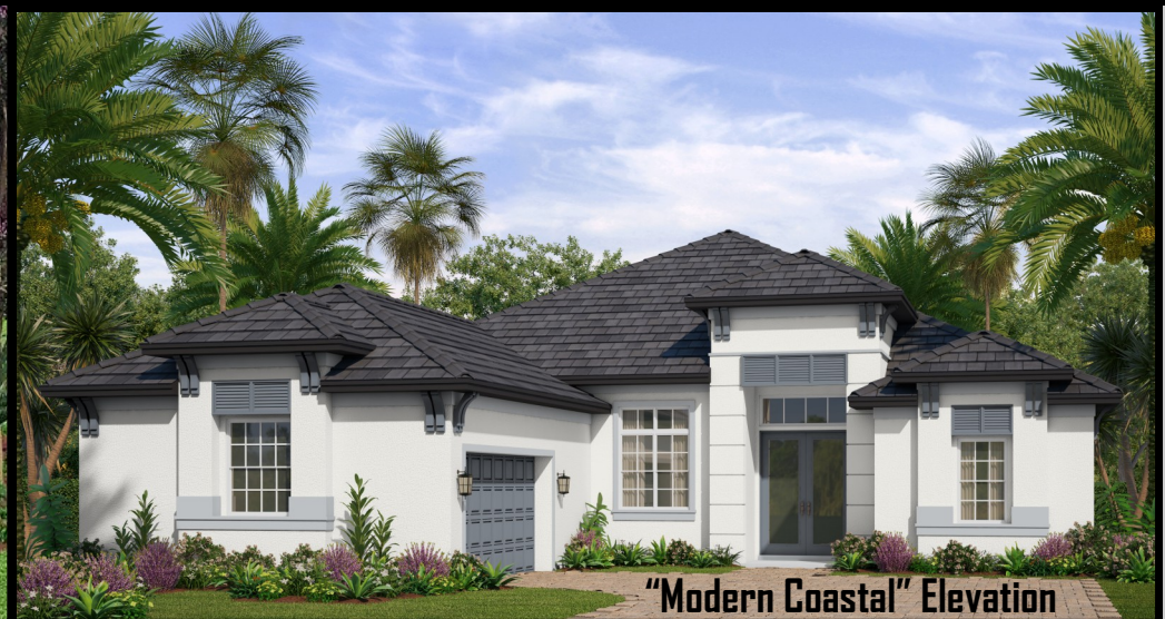
"Modern Coastal" Elevation