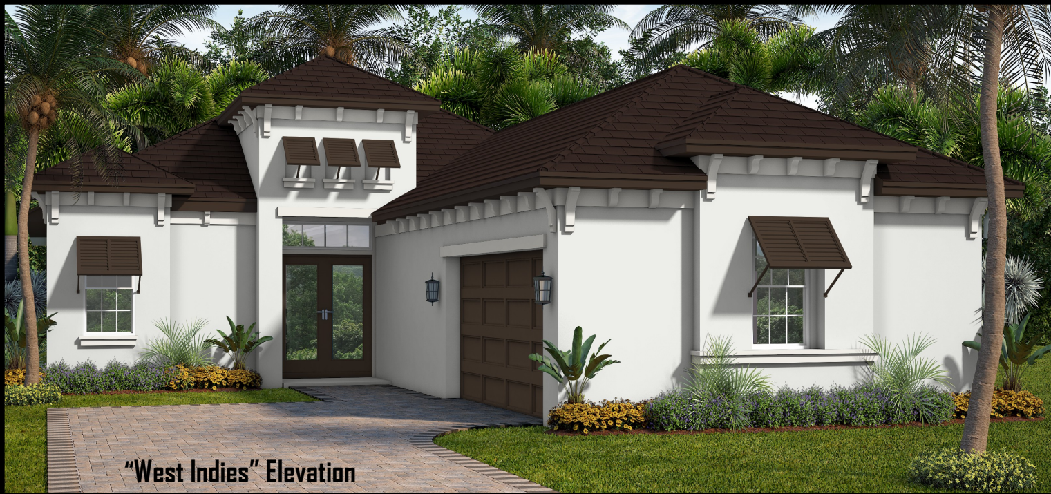
"West Indies" Elevation

~ Available In Several Front Elevation Styles ~ Gold Coast Custom Homes Has Perfected The Process Of Delivering High Quality Custom Homes For Our Clients. Our Carina Plan Is a 45' Wide Plan Perfect For Most Gated Communities. With 2008 Living Sqft, This Well Crafted 3 Bedroom 2.5 Bath With Study Features An Open Great Room Layout Perfect For Today's Life Style. All Our Homes INCLUDE Many Upgrades Standard: 11'-12'+ Ceilings In The Main Areas, (3) Tray Ceilings, Brick Pavers, Large Island In Kitchen, High Quality Tile In Main Areas of Home, Custom 42" Maple Cabinetry W. Crown Molding, Light Rail In The Kitchen, Plus Much, Much More! Call Today To Discuss The Next Steps In Building Your Dream Home.