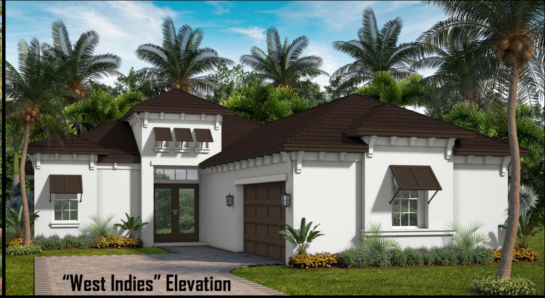
"West Indies" Elevation