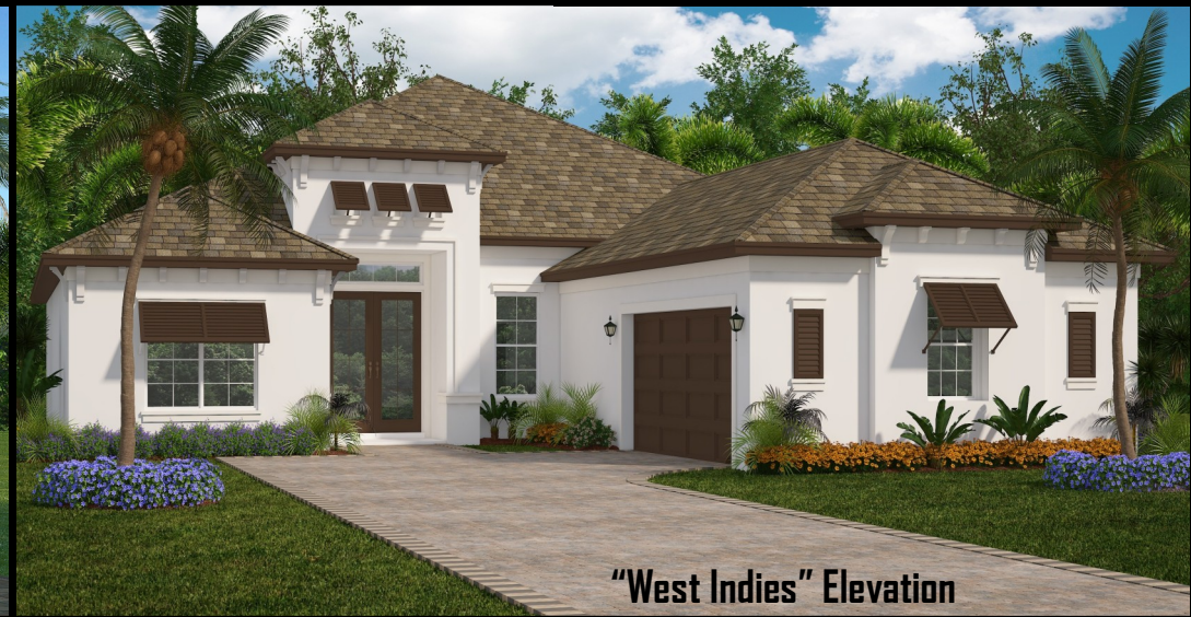
"West Indies" Elevation