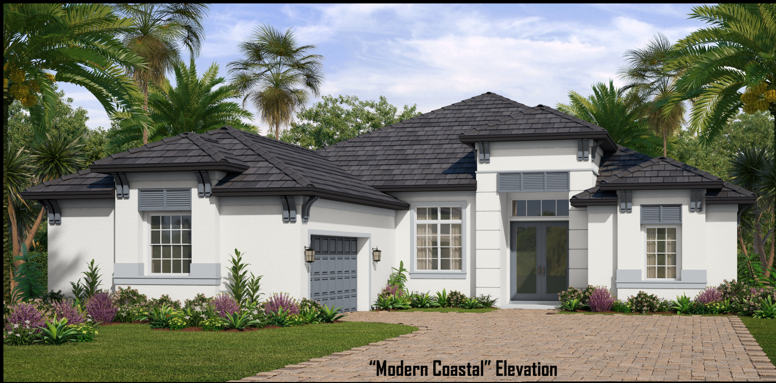
"Modern Coastal" Elevation

~ Available In Several Front Elevation Styles ~ Gold Coast Custom Homes Has Perfected The Process Of Delivering High Quality Custom Homes For Our Clients. Our Barbados Plan Is One Of Our Wider Lot Homes. With 2543 Living Sqft, This Meticulously Designed 3 Bedroom, 3 Bath With Study Is Our Most Popular Layout Featuring A Spaciously Open Great Room Layout Perfect For Today's Active Life Style. All Our Homes INCLUDE Many Upgrades Standard: 11'-12'+ Ceilings In The Main Areas, (3) Tray Ceilings, Brick Pavers, Large Island In Kitchen, High Quality Tile In Main Areas, Custom 42" Maple Cabinetry W. Crown Molding & Light Rail In The Kitchen, Plus Much, Much More! Call Today To Discuss The Next Steps In Building Your Dream Home.