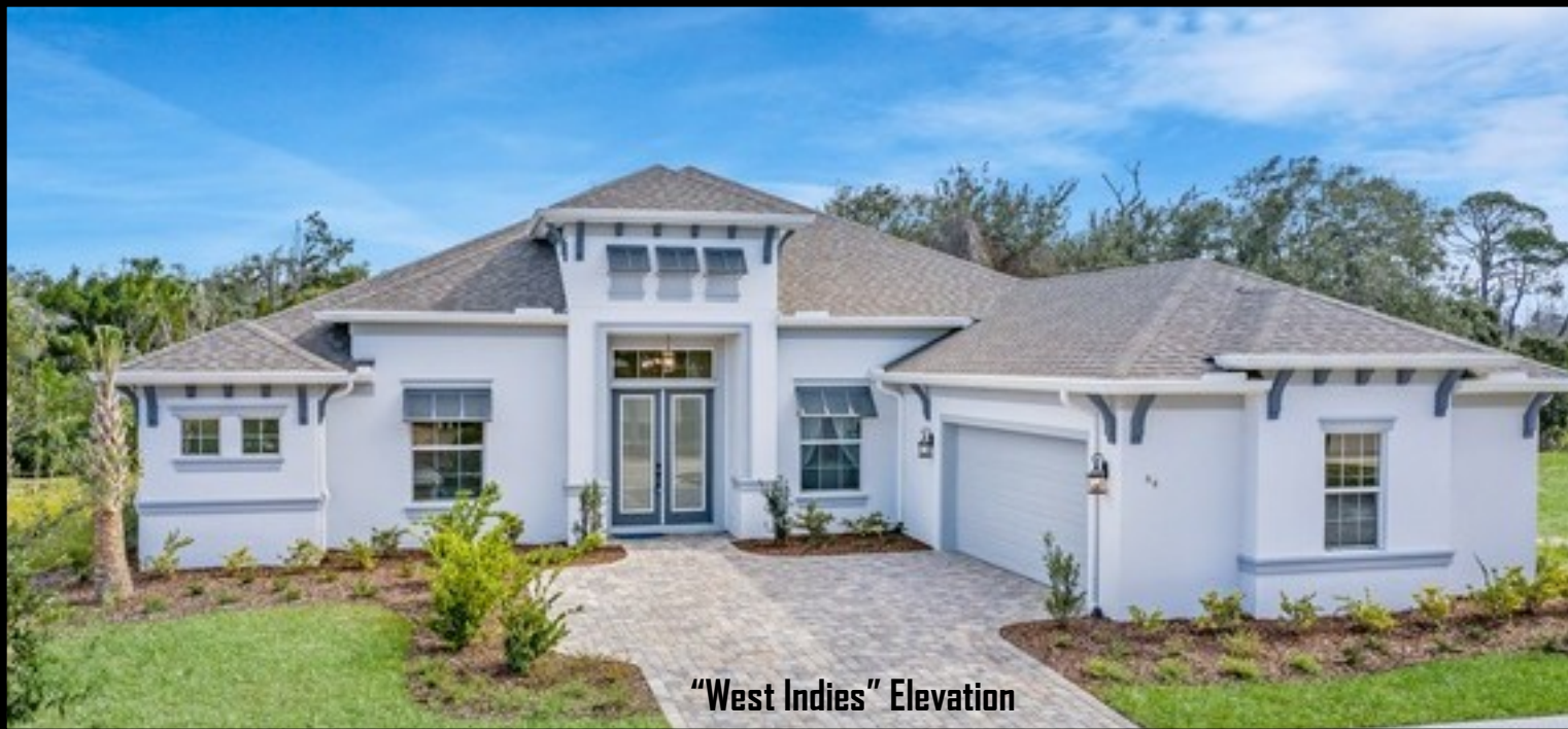
"West Indies" Elevation

~ Available In Several Front Elevation Styles ~ Gold Coast Custom Homes Has Perfected The Process Of Delivering High Quality Custom Homes For Our Clients. Our "Palm Beach" Plan Features A Formal Dining Room With An Open Great Room Layout. With 2500 Living Sqft, This Well Designed 3 Bedroom 3 Bath With Study Features Is Ideal For A Wider Property. All Our Homes INCLUDE Many Upgrades Standard: 11'-12'+ Ceilings In The Main Areas, (3) Tray Ceilings, Brick Pavers, Large Island In Kitchen, High Quality Tile In Main Areas Of Home, Custom 42" Maple Cabinetry W. Crown Molding, Light Rail In The Kitchen, Plus Much, Much More! Call Today To Discuss The Next Steps in Building Your Dream Home.