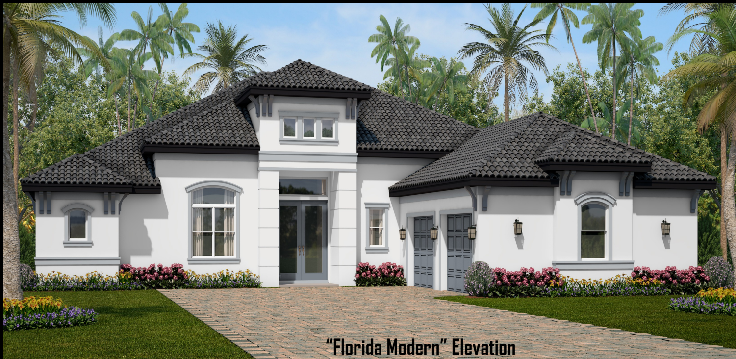
"Florida Modern" Elevation

~Available In Several Front Elevation Styles~ Gold Coast Custom Homes Has Perfected The Process Of Delivering High Quality Custom Homes For Our Clients. Our Naples Plan Is A Spaciously Designed Luxurious Custom Home. With 2852 Living Sqft, This Custom Designed 4 Bedroom 3 Bath With Study Features A Grand Open Great Room Layout Perfect For Today's Florida Life Style. Our Homes INCLUDE Many Upgrades Standard: 11'-12'+ Ceilings In The Main Areas, (3) Tray Ceilings, Brick Pavers, Large Island In Kitchen, High Quality Tile In The Main Areas Of Home, Custom 42" Maple Cabinetry W. Crown Molding, Light Rail In The Kitchen, Plus Much, Much More! Call Today To Discuss The Next Steps In Building Your Dream Home.