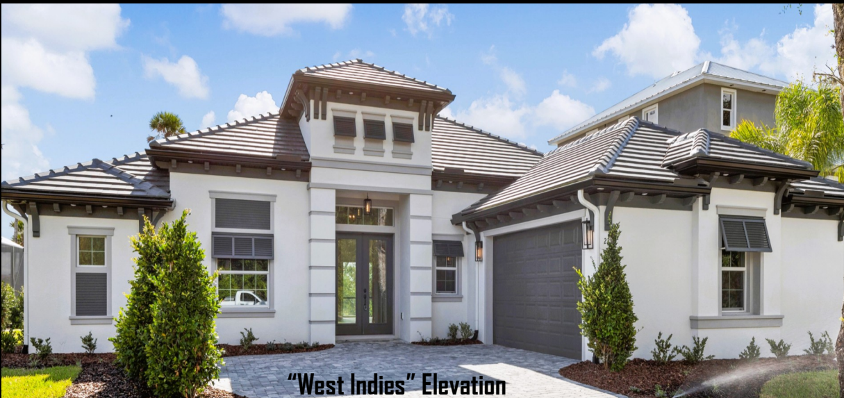
"West Indies" Elevation