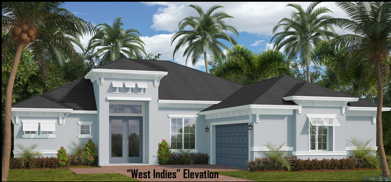
"West Indies" Elevation

~ Available In Several Front Elevation Styles ~ Gold Coast Custom Homes Has Perfected The Process Of Delivering High Quality Custom Homes For Our Clients. Our Augusta Plan Is One Of Our Favorite Plans. With 2202 Living Sqft, This Great Room Open Design Is 3 Bedrooms 2 Baths With A Study. Our Homes INCLUDE Many Upgrades: 11'-12'+ Ceilings (3) Tray Ceilings, Brick Pavers, Large Island In Kitchen, High Quality Tile In Main Areas Of Home, Custom 42" Maple Cabinetry W. Crown Molding, Light Rail In The Kitchen Plus Much, Much More! Call Today To Discuss The Next Steps In Building Your Dream Home.